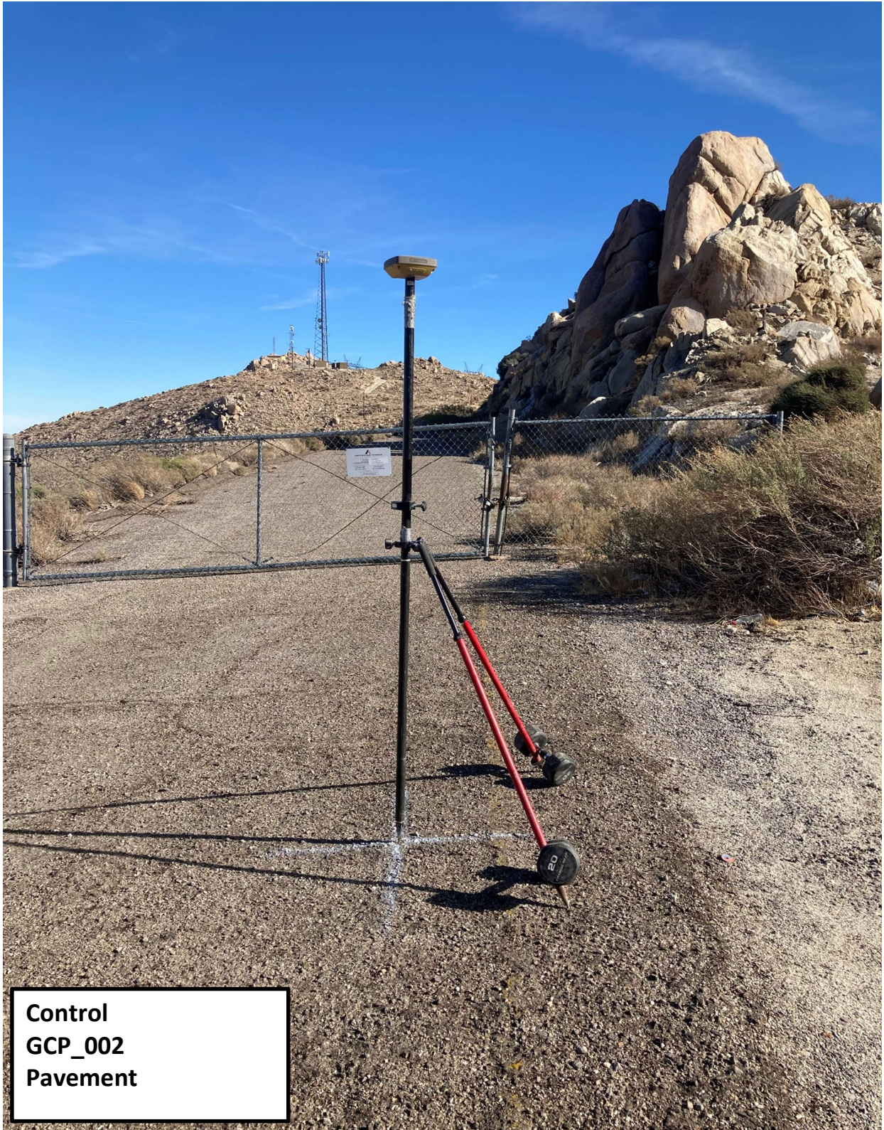
Control GCP_002 Pavement