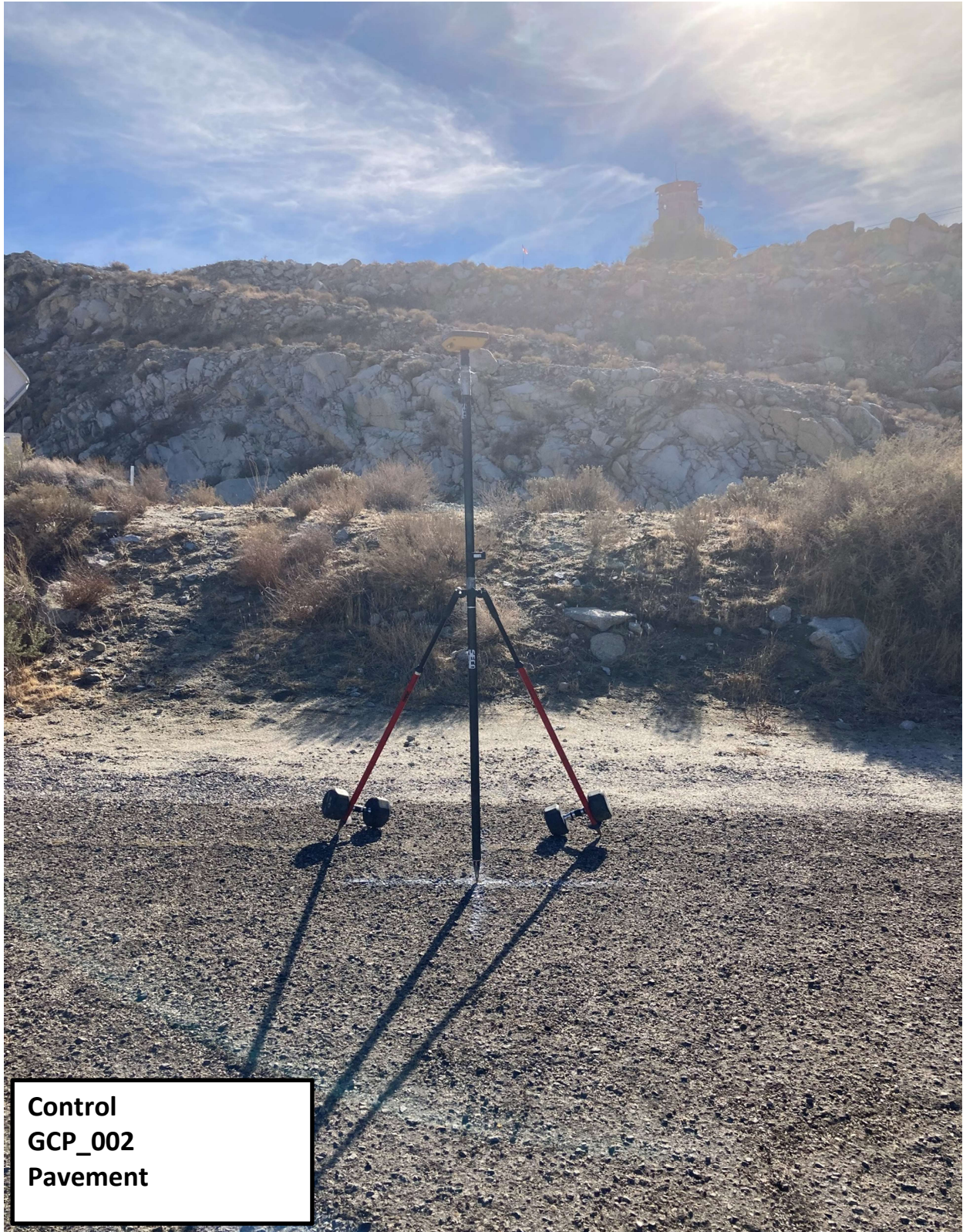
Control GCP_002 Pavement