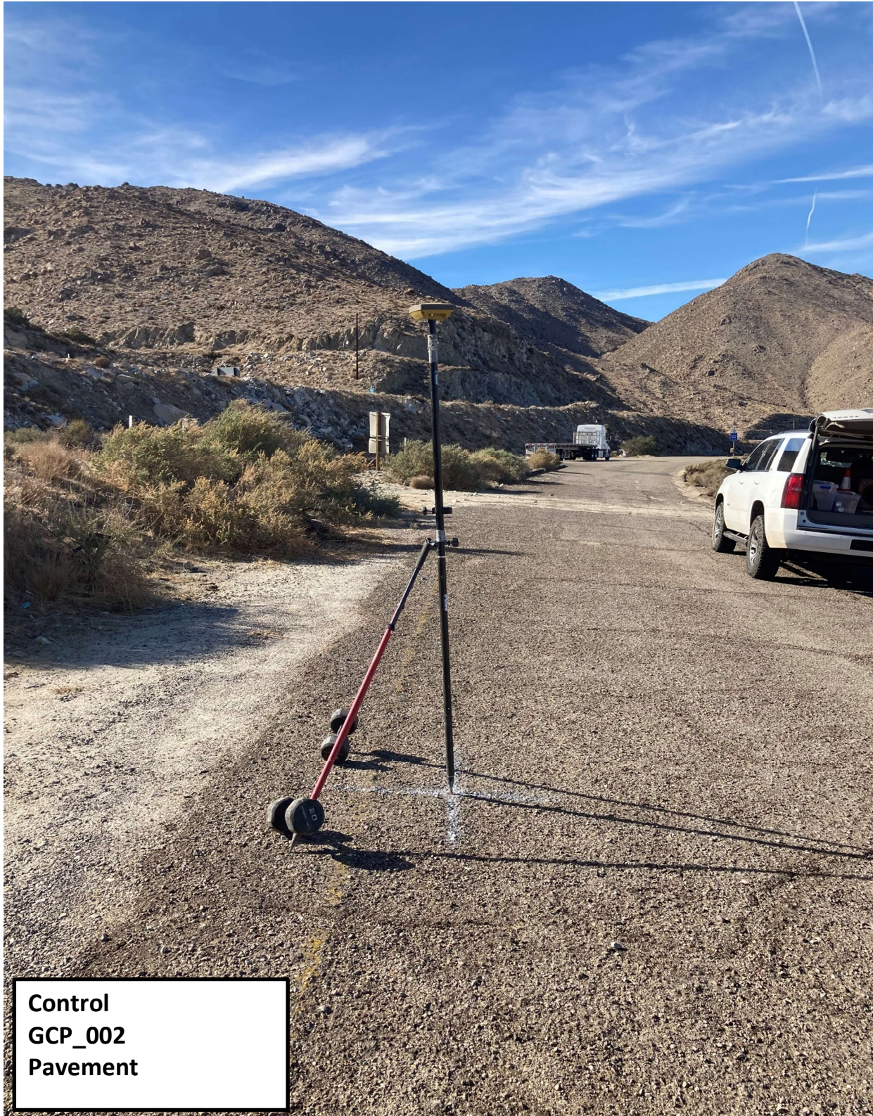
Control GCP_002 Pavement