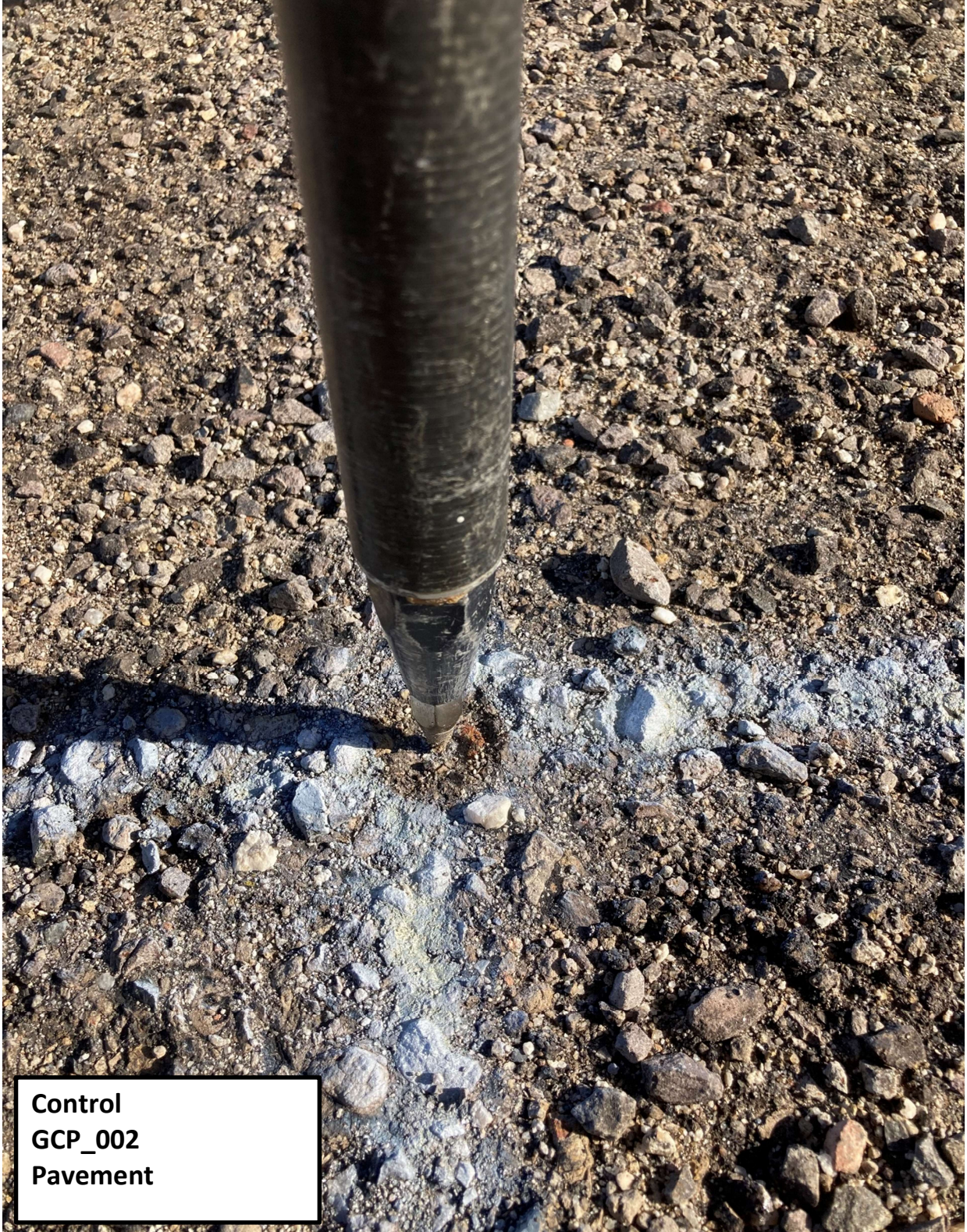
Control GCP_002 Pavement