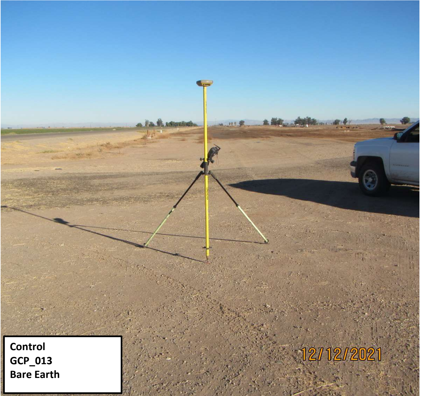
Control GCP_013 Bare Earth