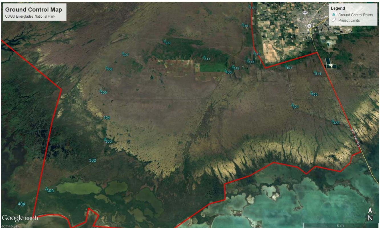
Ground Control Point Map (South)