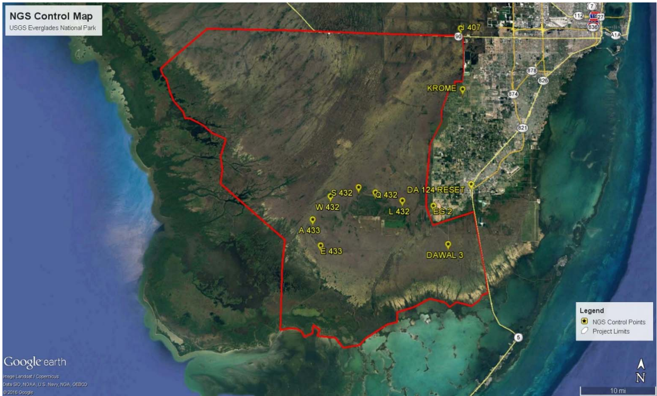
NGS Control Map