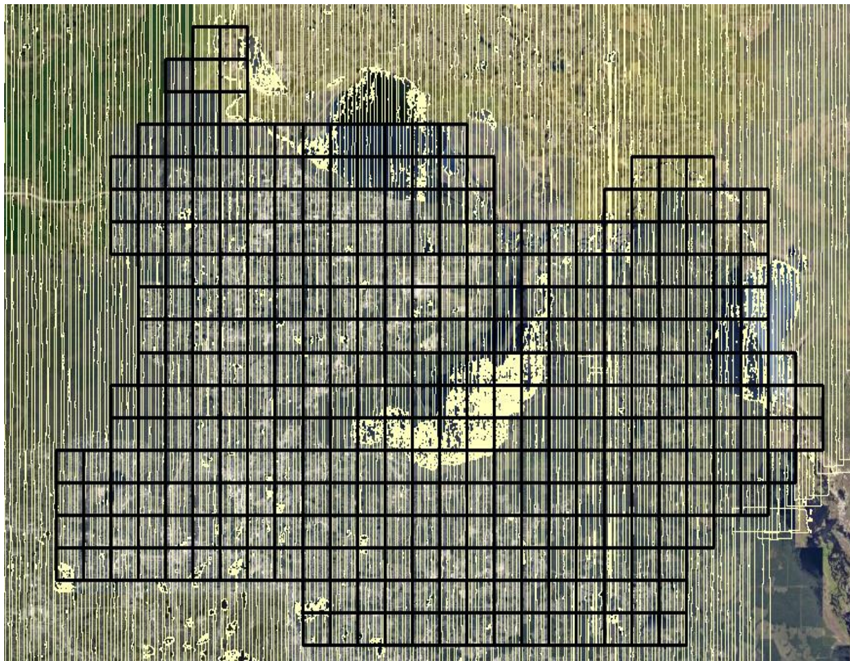
Figure 2. Lidar swath output showing complete coverage.