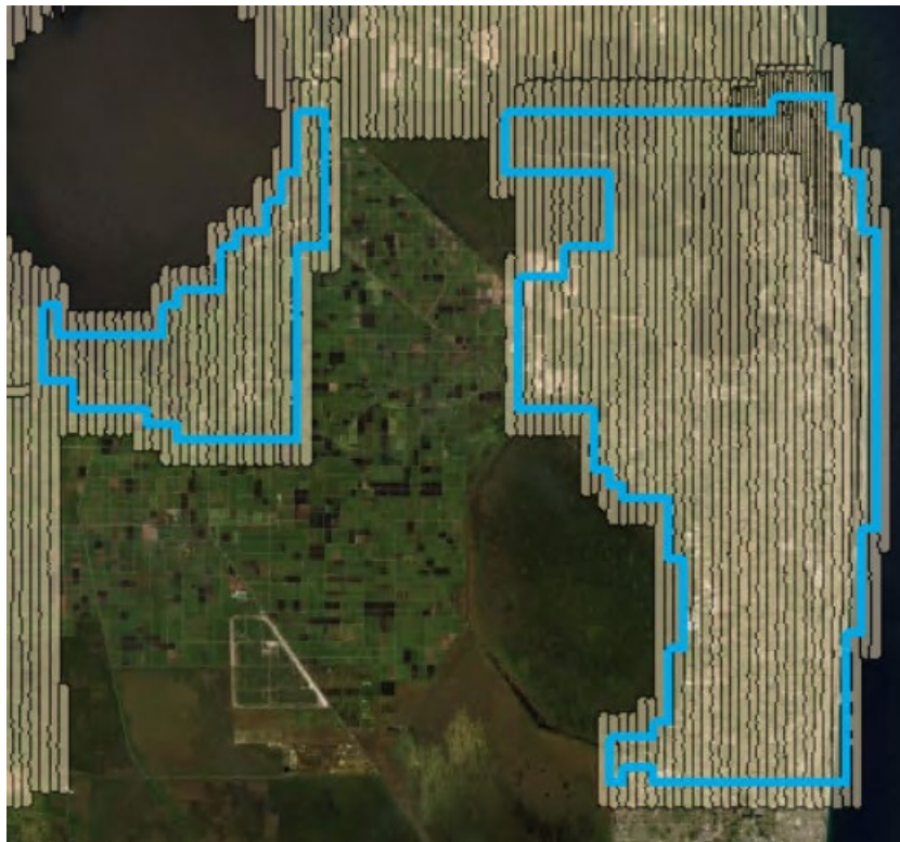
Figure 2 - Lidar swath output showing complete coverage.

control files were reviewed and logged. A supplementary coverage check was carried out (Figure 2) to ensure that there were no unreported gaps in data coverage.