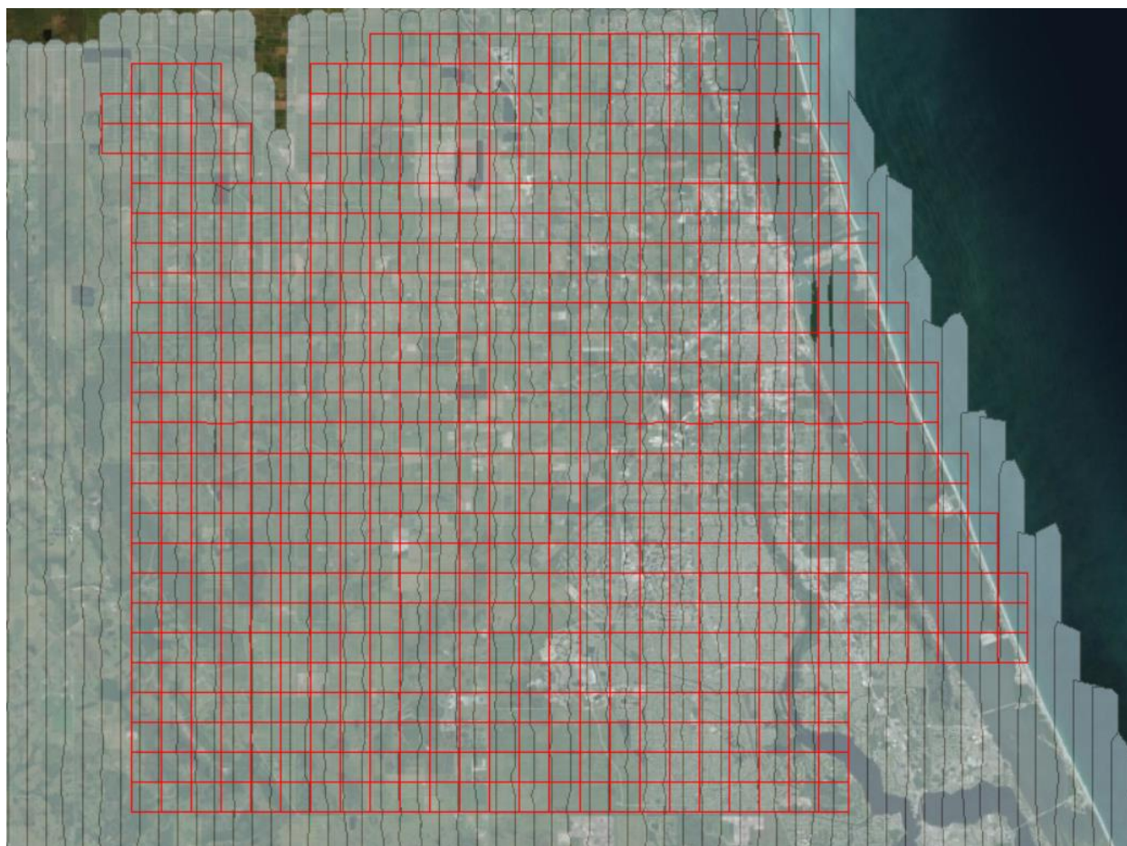
Figure 3. Lidar swath output showing complete coverage.

Data collected by the lidar unit was reviewed for completeness, acceptable density, and to make sure all data were captured without errors or corrupted values. All GPS, aircraft trajectory, mission information, and ground control files were reviewed and logged. A supplementary coverage check was carried out (Figure 3) to ensure that there were no unreported gaps in data coverage.