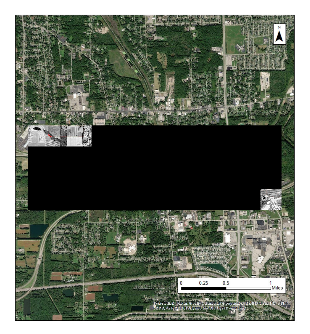
Figure 3-1. Swath Separation Image