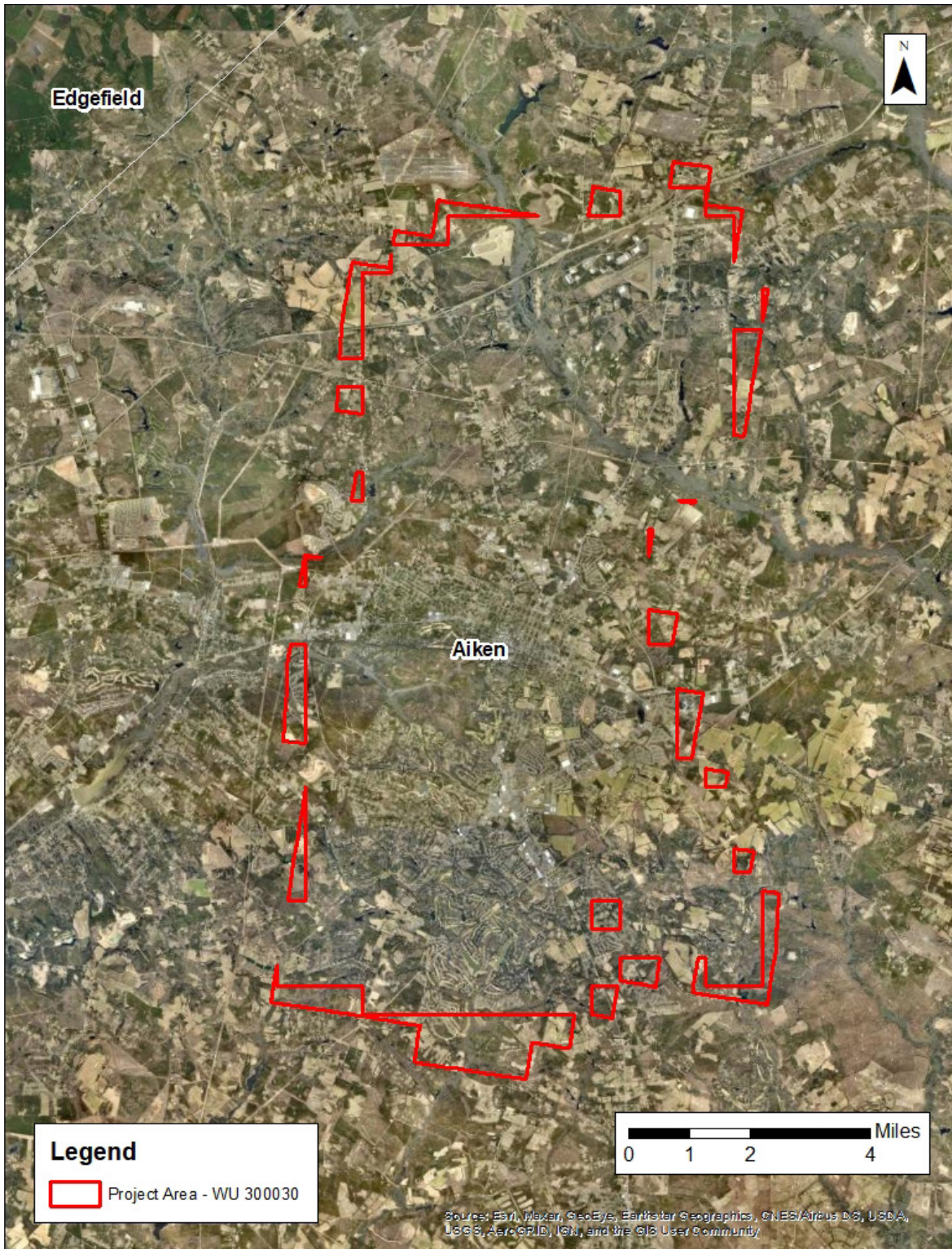
Figure 1-2. Project Area - SC_SavannahPeeDee_8_2019