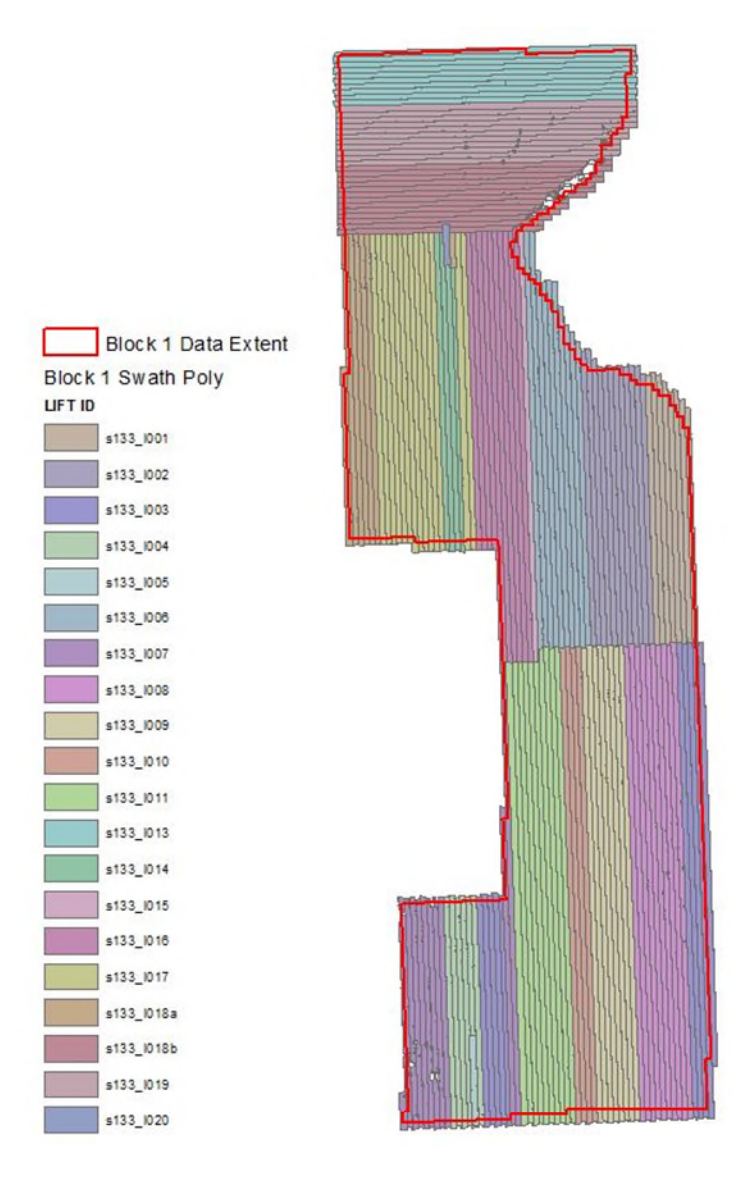
Figure 1: Block 1 Flightline vectors