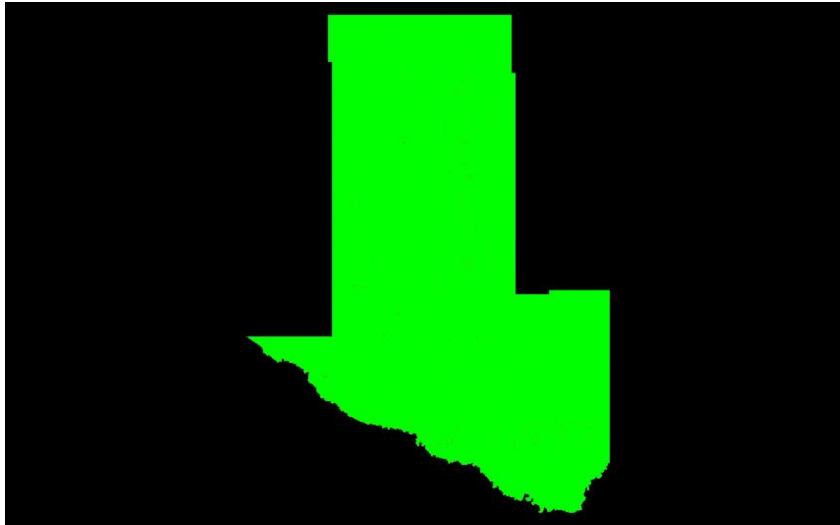
First Return Point Density Map

QL2 selected Required QL2 NPS \leq 0.71 meters First return point count computed using a cell size of 1.42 meters (2 x 0.71)