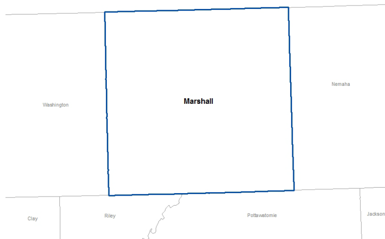
Figure 1 Marshall County Project Area

This report covers the collection of LiDAR elevation data over Marshall County. The project limits are presented in the graphics below. The project area consisted of approximately 900 square miles of elevation data.