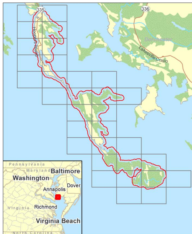
Figure 1 - Tile grid and project boundary of the Hooper's Island project area.