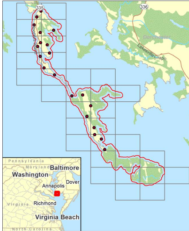
Figure 2 – Checkpoint Map shows that checkpoints are well distributed throughout project area.

The tables below show the vertical accuracy statistics and results. FVA (Fundamental Vertical Accuracy) is determined with check points located only in land cover category, open terrain (grass, dirt, sand, and/or rocks), where there is a very high probability that the LiDAR sensor will have detected the bare-earth ground surface and where random errors are expected to follow a normal error distribution. The FVA determines how well the calibrated LiDAR sensor performed. With a normal error distribution, the vertical accuracy at the 95% confidence level is computed as the vertical root mean square error (RMSE Z ) of the checkpoints x 1.9600.