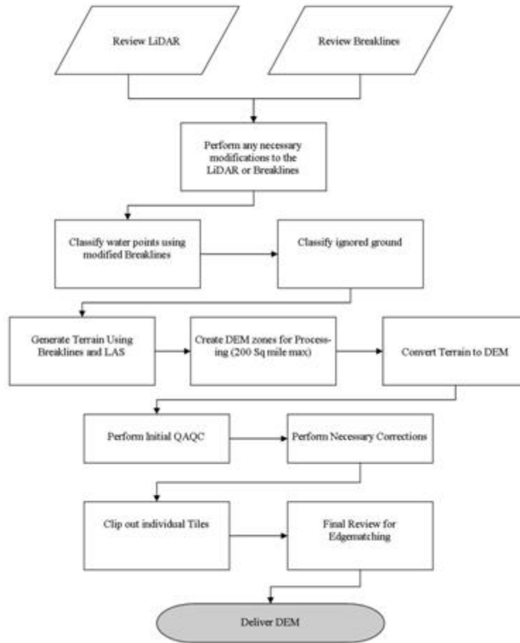
Figure 4 – Dewberry’s DEM Workflow