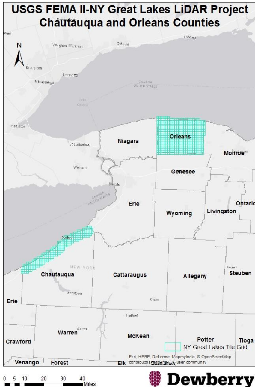
Figure 1: Project Map of Orleans and Chautauqua Counties.

Data was formatted according to tiles with each tile covering an area of 1,500 m by 1,500 m. A total of 3,070 tiles were produced for the project encompassing an area of approximately 2,667 square miles.